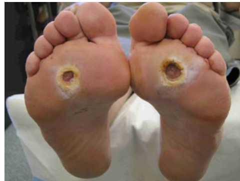
Above: Diabetic foot ulcers