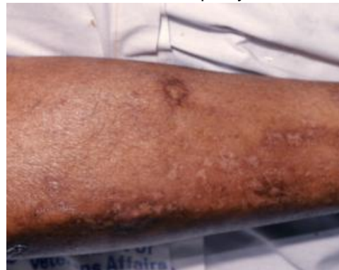
Below: Diabetic dermopathy